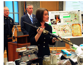
Main Line Drug Ring Charges