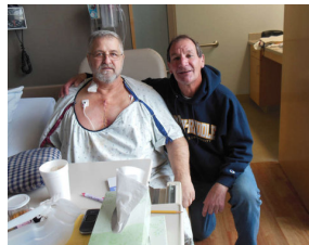
Once opposed to ACA, now a convert